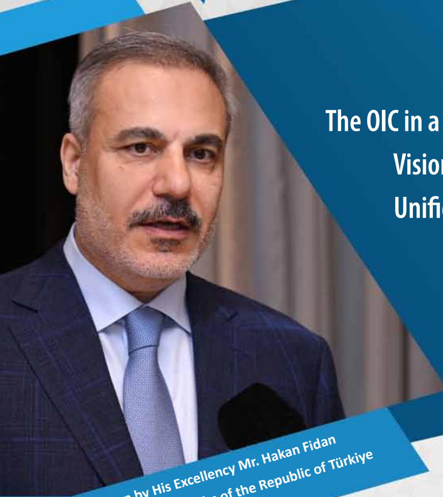
Written by His Excellency Mr. Hakan Fidan Minister of Foreign Affairs of the Republic of Türkiye