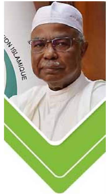
Hissein Brahim Taha

The responsibility of the OIC and its Member States in the coming period should focus on safeguarding the ceasefire agreement in Gaza, reached on October 9, 2025.