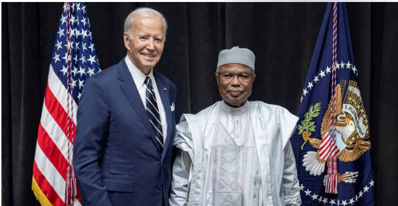
OIC Secretary-General H.E. Mr. Hissein Brahim Taha and US President Joe Biden in a ceremony on the sidelines of the General Assembly meetings.

On the sidelines of the 77th session of the United Nations General Assembly, the Foreign Ministers of the OIC Member States held, on September 22, 2022, at the UN headquarters in New York, the Annual Coordination Meeting (ACMOI).