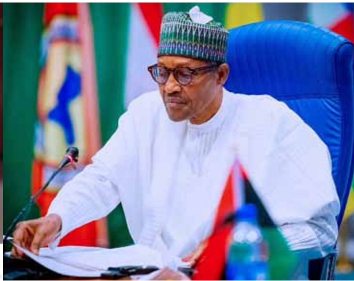
H. E. Nigeria's President Muhammadu Buhari