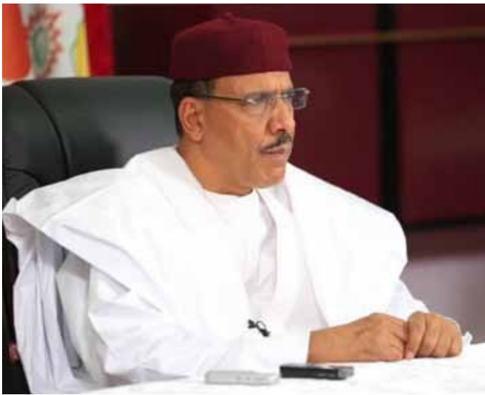
H. E. Niger's President Mohamed Bazoum