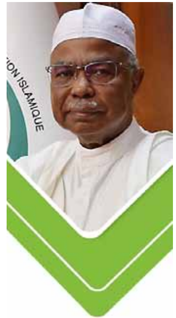
Hissein Brahim Taha

In the end, I would like to take this opportunity to thank the OIC Member States. The Organization, in fact, would not have been able to carry out its mandate had it not been for the support of its Member States which have provided everything necessary for it to accomplish its important collective work. Special thanks are due to the countries that were more involved during the past period, including the Kingdom of Saudi Arabia, the Republic of Türkiye, and the Islamic Republic of Pakistan, and to all who contributed to supporting the efforts of the OIC and amplifying the voice of the Muslim World.